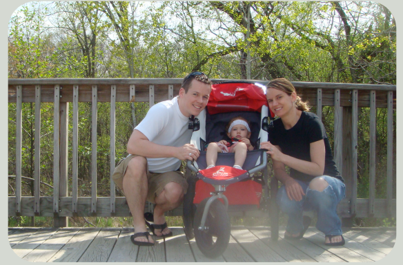
- An April stroll in the park