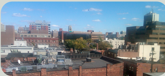
- Ann Arbor Cityscape

Please ask the Lord to speak clearly to those within NLCity who are to be a part of championing these dreams. Pray for clarity, discernment, and sensitivity to the Spirit's leading in this process. Ask God to reveal Himself in Great and Mighty ways to those who call Ann Arbor home.